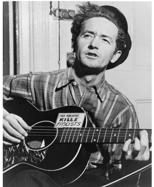
Mr. Woody Guthrie playing his emblematic guitar.

Mr. Woody Guthrie was born in 1912 in a small town in Oklahoma called Okemah. He is a singer-songwriter and musician whose musical legacy includes hundreds of political, traditional, and children's songs. Many of his songs are about his experiences during the Great Depression when he traveled with displaced farmers from Oklahoma to California and learned their traditional folk and blues songs, earning him the nickname the "Dust Bowl Troubadour".