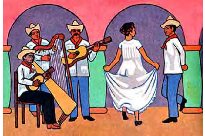
A typical “son jarocho” group with dancers.

Listen to the instruments played in “ La Golondrina ”. The first instrument you hear is a requinto from the same family as the jarana , and is the one in charge of introducing the melody of the song. Other than the jarana , the leona and the violin , can you guess which other instruments are being played? Who's playing the percussion in the ensemble? Which of these instruments are common in other music? What instruments are different?.