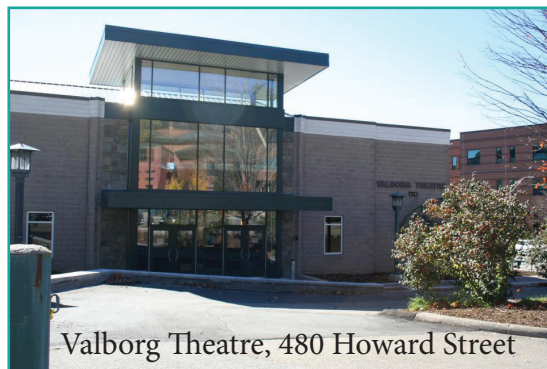
Valborg Theatre, 480 Howard Street